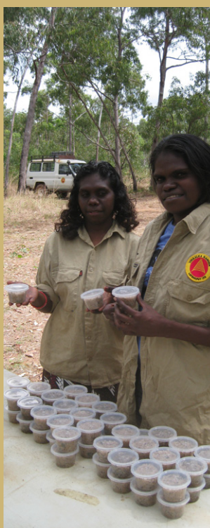
Yirralka Miyalk Rangers selling bush products at Garma Festival.