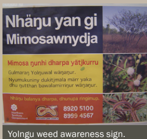
Yolngu weed awareness sign.