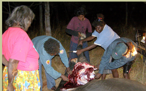
Yugul Mangi Rangers doing buffalo disease check post mortem.