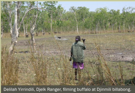
Delilah Yirrindili, Djelk Ranger, filming buffalo at Djinmili billabong.