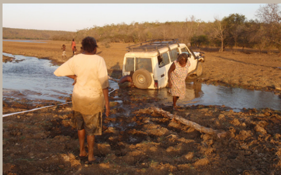
Yugul Mangi Rangers bogged in early wet season.