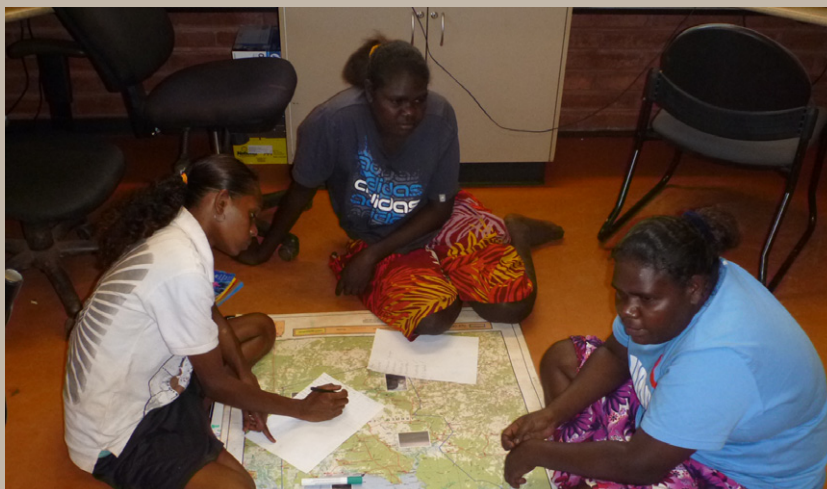
Djelk Rangers identifying weedy locations in the IPA.