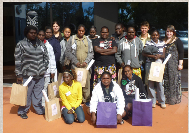
Women's workshop 2012, Australian Institute for Aboriginal and Torres Strait Islanders Studies.