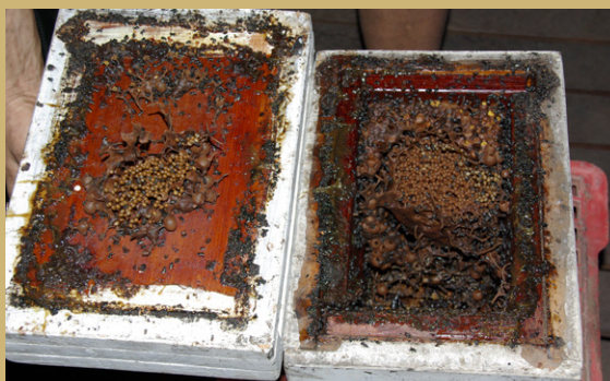
Inside a sugarbag bee hive box.