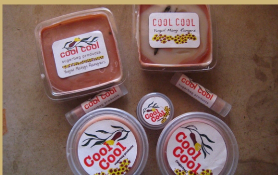
Yugul Mangi Rangers bush medicine products.