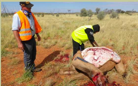
Ngannyatjarra mob harvesting camel meat.

The types of feral animal work we do are: