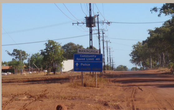
Maningrida community, Djelk IPA.