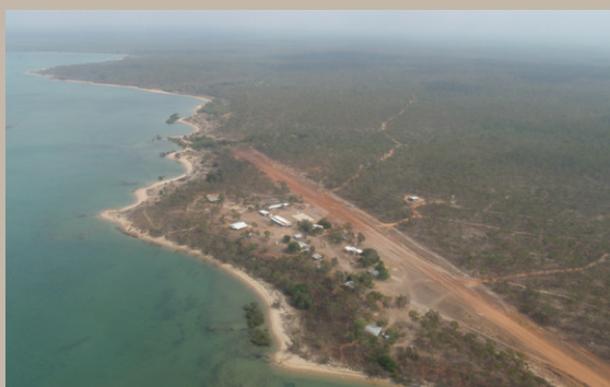
Garrthalala homeland, Laynhapuy IPA.