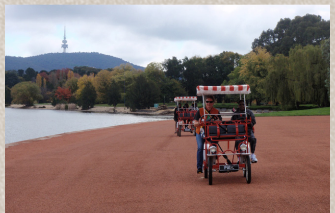
Cycling around Lake Burley Griffin, second women's workshop, Canberra.