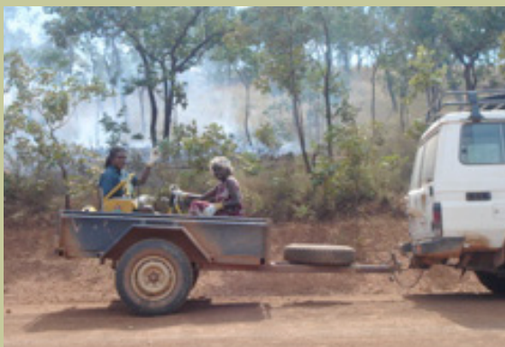
Yugul Mangi Rangers using launcher for roadside control burning.