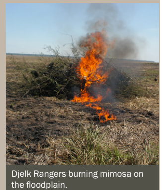
Djelk Rangers burning mimosa on the floodplain.