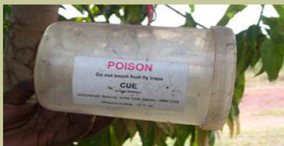
Djelk Rangers Fruit fly trap.

D jama (work) we do for AQIS is manymak (good) and good fun but it is important djama to get rid of the Anopheles gracilepis or the mosquito because it brings disease to gatapan (buffalo), bulliki (cattle) and other feral wayin (animals).