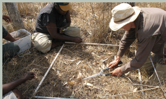
Yugul Mangi Rangers working with Bushfires NT to measure fire fuel loads for carbon accounting.