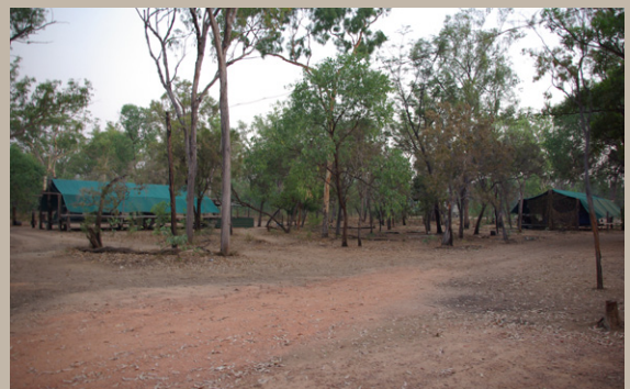
Kabulwarnamyo outstation, Warddeken IPA.