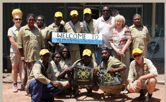
Yirralka Rangers at Yilpara Homeland, Laynhapuy IPA.