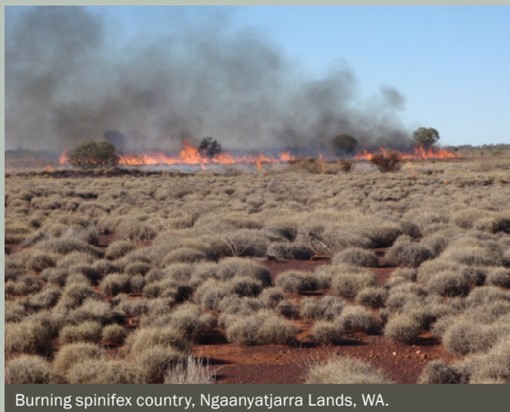
Burning spinifex country, Ngaanyatjarra Lands, WA.