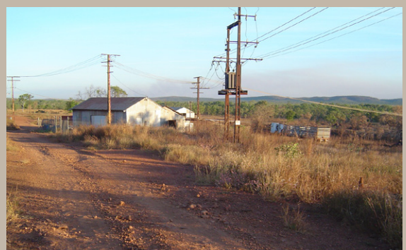
View to Yugul Mangi Rangers shed, SE Arnhem Land.