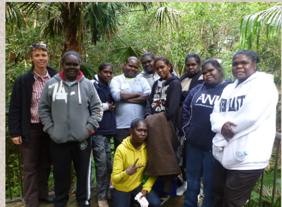
Women's workshop 2012, Australian National Botanic Gardens.