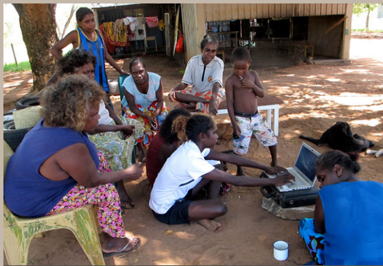
Manwurrk rangers in their bush office at Manmoyi.