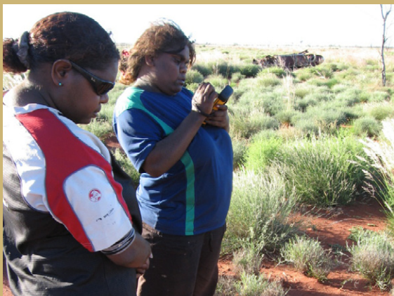
Ngaanyatjarra Ladies recording fauna tracks.

CyberTracker is being used by many Indigenous and non-Indigenous ranger groups and scientists to collect data (information) on different types of work such as fire, weed and feral animal management, fauna (animals) and flora (plants) surveys and general work activity like hours worked and places worked. CyberTracker data collection is now also supported by the Federal Government through their Indigenous Ranger CyberTracker Program.