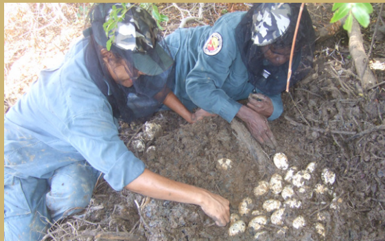
Yugal Mangi Rangers collecting saltwater crocodile eggs for sale.