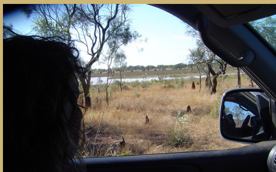
Cherry Daniels observing country from the Toyota.