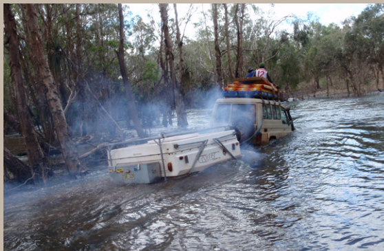
High flood waters limit access to neighbouring communities, although not for this keen family!