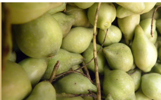
Djelk Rangers billy goat plum harvest.