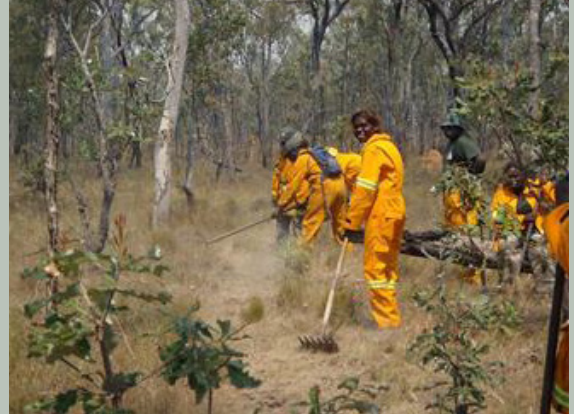
Manwurrk Rangers scraping a fire break.