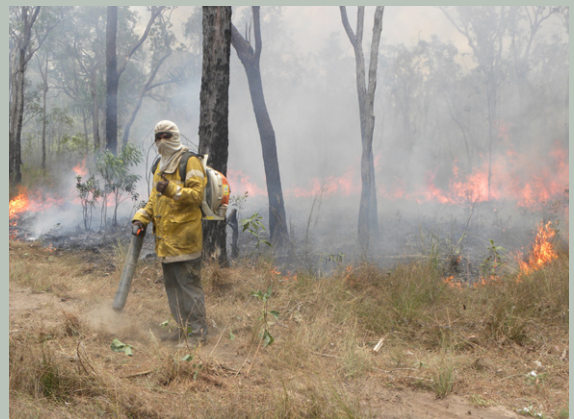
Djelk Ranger using a leaf blower to control fire.

W hat we like about burning – we go out on country and take old people camping, listening to old people tell stories how to use fire break for hunting kangaroo, emu, goanna and bush turkey.