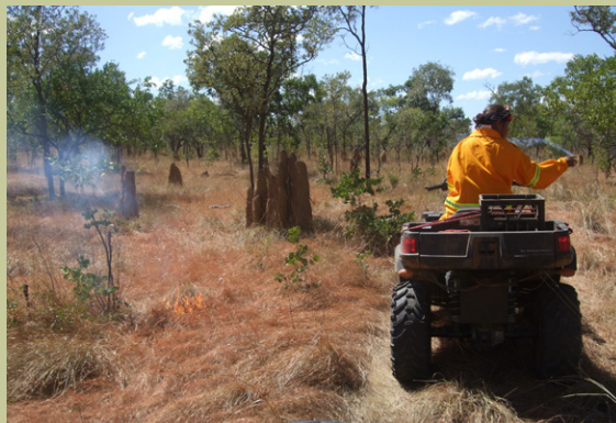
Priscilla Dixon, Yugul Mangi Ranger, control burning using quad bike.