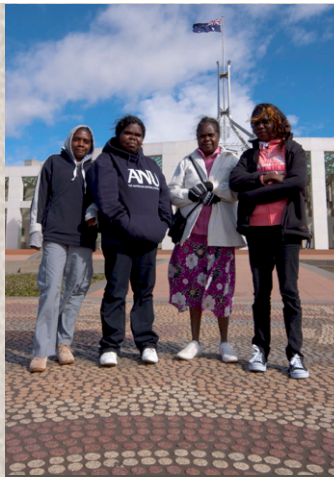
Manwurrk Rangers at Parliament House, second women's workshop, Canberra.