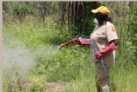
Yirralka Ranger spraying weeds.