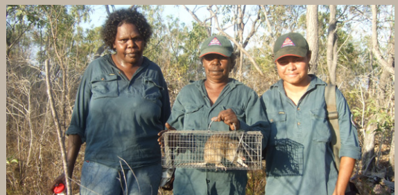
Yugul Mangi Rangers fauna survey at Maria Island.