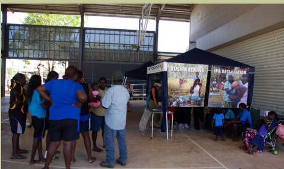
Warddeken IPA staff and friends raising awareness about their work at the 2011 Stone Country festival in Kunbarllanjnja.