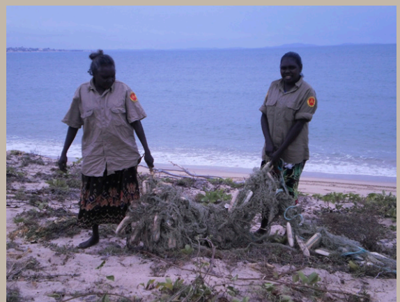
Yirralka Rangers cleaning up ghost nets in along western side of the Gulf of Carpentaria