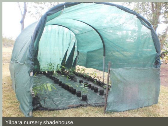
Yilpara nursery shadehouse.