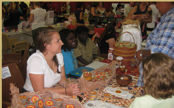
Yirralka Rangers selling bush medicine products at the market.