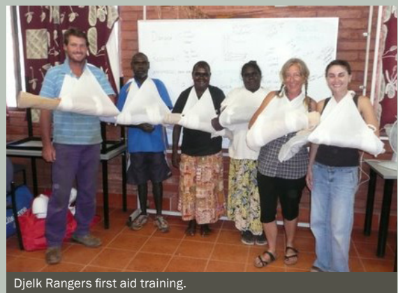
Djelk Rangers first aid training.