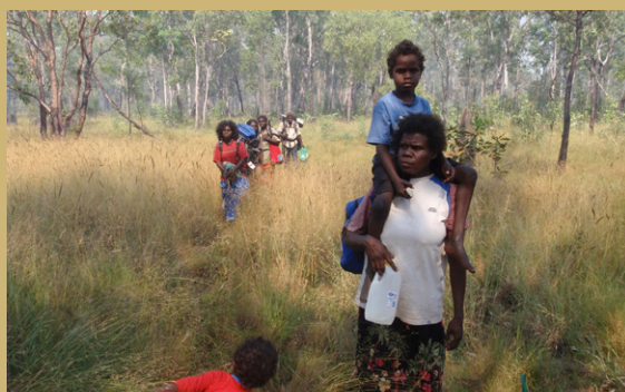
Manwurrk Rangers and their families on 2010 Stone Country walk.