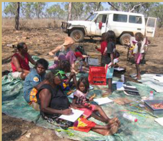
Yugul Mangi Rangers working with school kids.