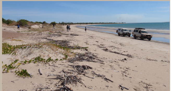
Djelk Rangers doing beach clean up.