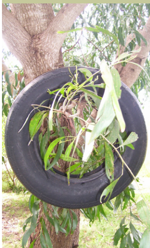
Djelk Rangers mosquito collection tyre for AQIS.