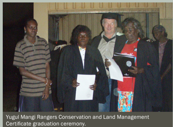
Yugul Mangi Rangers Conservation and Land Management Certificate graduation ceremony.