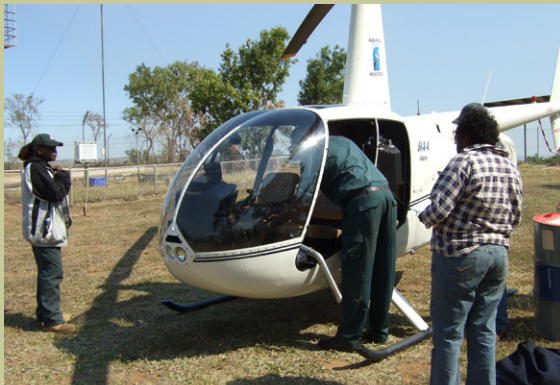
Yugul Mangi Rangers preparing for aerial burning.