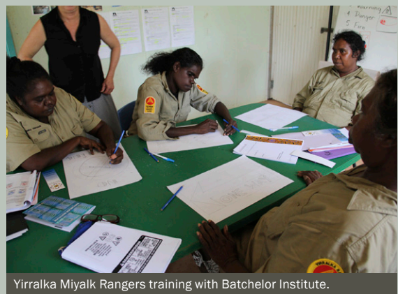
Yirralka Miyalk Rangers training with Batchelor Institute.