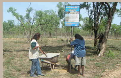
Yugul Mangi Rangers putting up weed awareness sign.