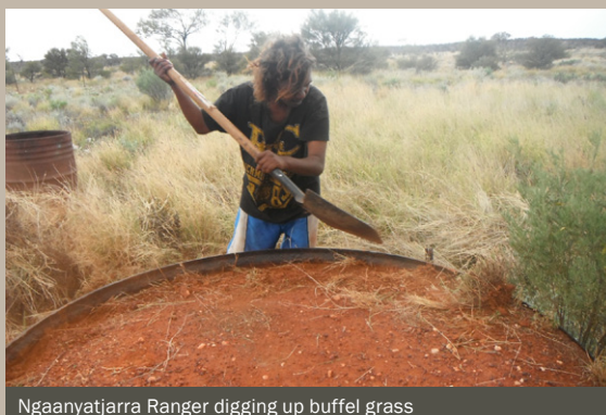
Ngaanyatjarra Ranger digging up buffel grass