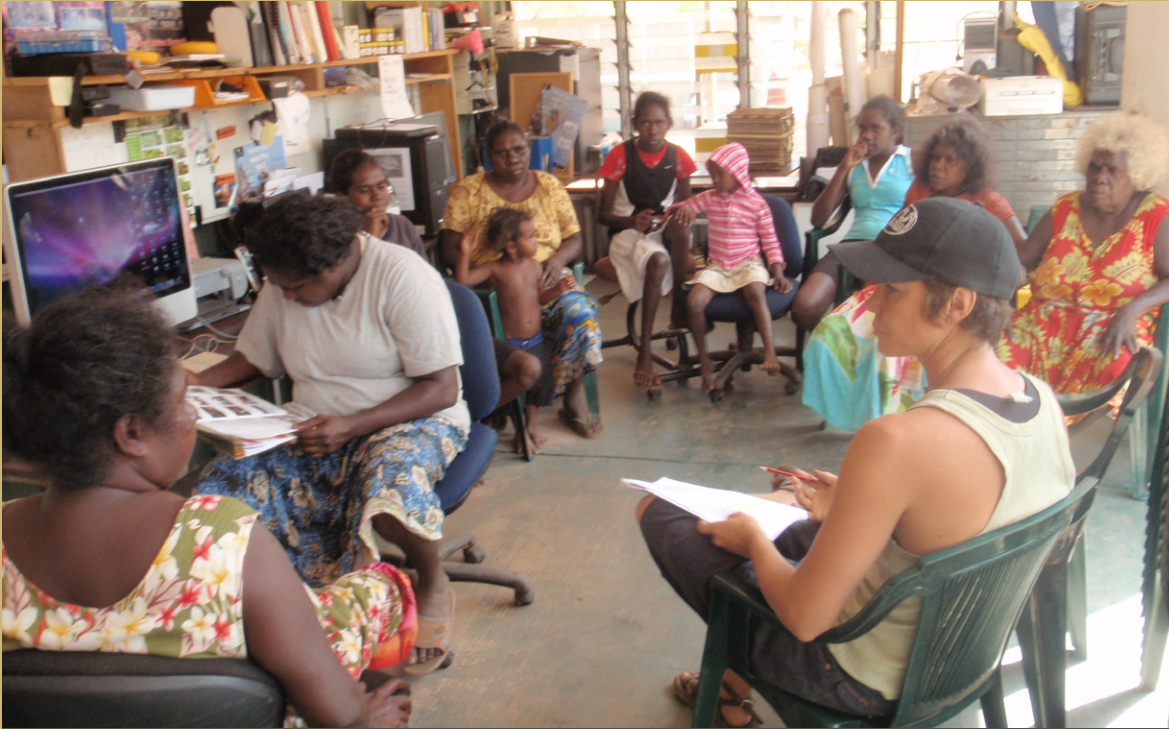
Nursery meeting at Kabulwarnamyo.