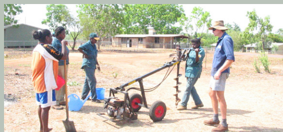
Yugul Mangi Rangers digging holes to plant shade trees around Ngukurr.