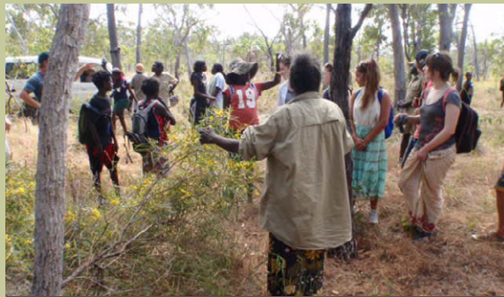
Yirralka Rangers showing school students from Melbourne around their homelands in the Laynhapuy IPA.