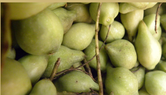
Djelk Ranger billy goat plum harvest.