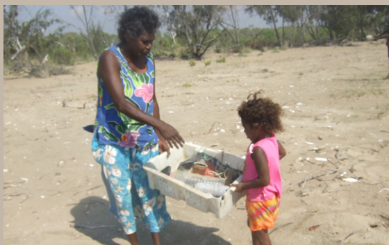
Family helping Yugul Mangi Rangers clean beach at Wiyagiba.