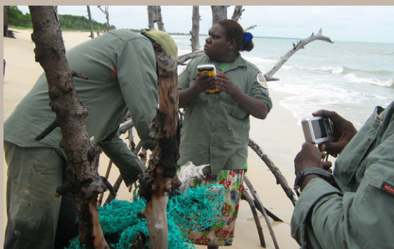
Djelk Rangers recording ghost nets along north Arnhem coast.