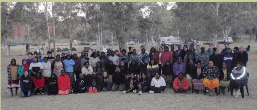
Participants of the 2010 NT women rangers conference at Ross River.