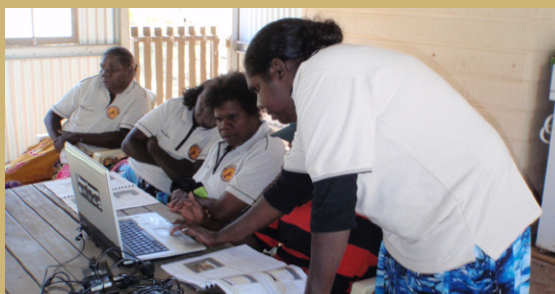
Manwurrk Rangers learning how to set up their own CyberTracker sequence.