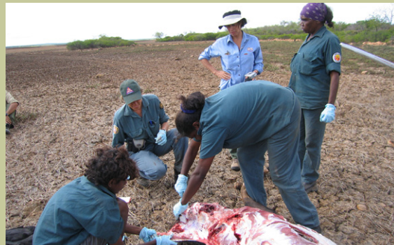
Yugul Mangi Rangers conducting post mortem disease checks.