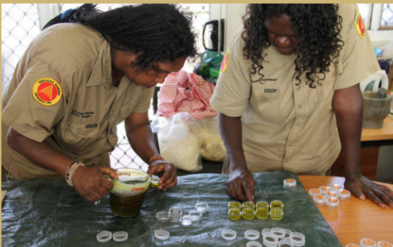
Yirralka Rangers making bush medicine products for sale.

However none of these initiatives have brought substantial income or profit to date and many are only short term projects. One project that does seem to be delivering some success to date is the Yirralka Miyalk Rangers bush medicine products ranger including oils, creams, shampoo and lip gloss. The rangers have been producing and selling these products at local markets with assistance from Aboriginal Bush Traders, a not-for-profit initiative of the Darwin Regional Indigenous Advancement and CDEP Inc.