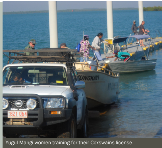
Yugul Mangi women training for their Coxswains license.