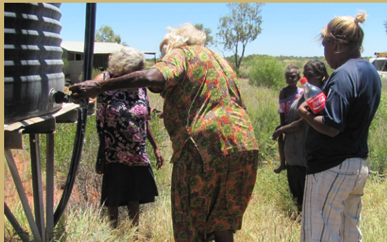
Ngaanyatjarra mob assessing bores and buffel grass.