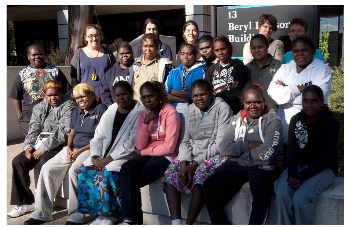
2012 Indigenous women rangers workshop participants

On 23–27 April 2012, a second Indigenous women rangers workshop was held at the ANU (Canberra). Seventeen Indigenous women rangers from four ranger group partners as well as rangers from the Ngaanyatjarra Lands (Western Australia) attended. This time, the purpose of the workshop was to collaboratively produce a booklet and a DVD using the material collected the previous year. Targeted to inform the funding bodies, government agencies and broader community, this booklet and DVD aim at improving Indigenous women rangers' opportunities and outcomes by promoting and raising awareness about their work, realisations, challenges and aspirations.